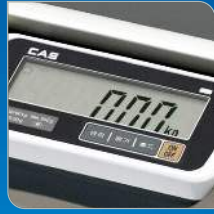
Large LCD display