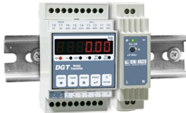
DGT1 with DR1512 optional power supplier, for DIN bar